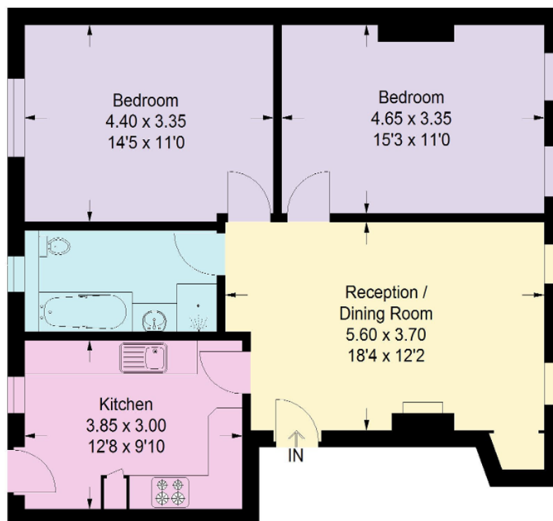
Illustration For Identification Purposes Only. Not To Scale (ID:346862 / Ref:60859)

Approximate Gross Internal Area 72.6 sq m / 781 sq ft